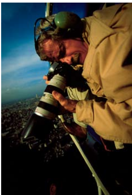
YPT-0001-04 Yann Arthus Bertrand - Taking photograph from helicopter

A spectacular outdoor exhibition of giant aerial images captured by internationally renowned photographer Yann Arthus-Bertrand will be revealing the world in all its fragile beauty at Oxford Castle.