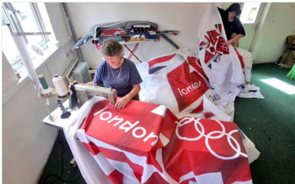
Workers from Piggotts put finishing touches to UK Olympic Handover Flags

See www.oxfordinspires.org for details of these events. ❖